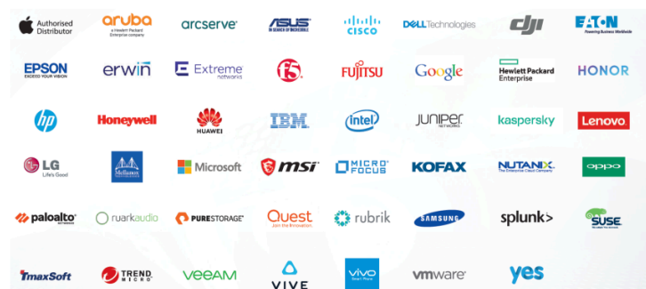
Figure 2: VSTECS is one of the largest distributors of ICT products in ASEAN